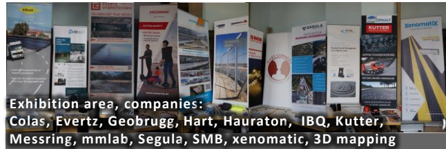
Exhibition area, companies: Colas, Evertz, Geobruigg, Hart, Hauraton, IBQ, Kutter, Messring, mmlab, Segula, SMB, xenomatic, 3D mapping