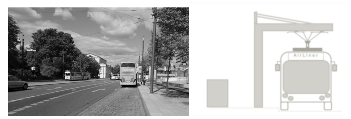
Figure 1: Stop at Congress Centre Darmstadt and layout of the charging station

The additional charging station will be located at the stop Congress Centre Darmstadt. The maximum charging power will be up to 300 kW. The suggested layout and the conditions on the spot are illustrated in Figure 1.